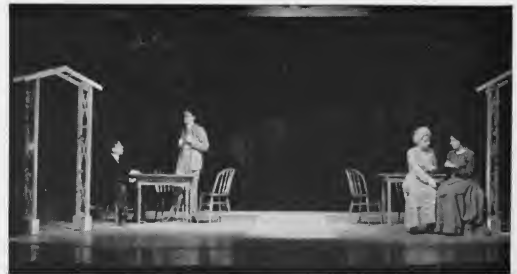
1937— Our Town —Nov., 1939*